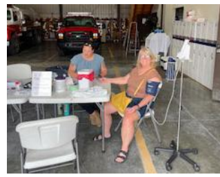
WOW at the Adams Emergency Services Building

August was a busy month with events at Mower County Fair, Dexter, Rose Creek, Mower County Senior Center, and Benin New Year where over 200 individuals this month received preventive screenings.