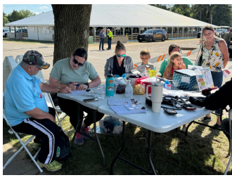
WOW at the Mower County Fair