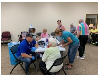
WOW at the Mower County Senior Center